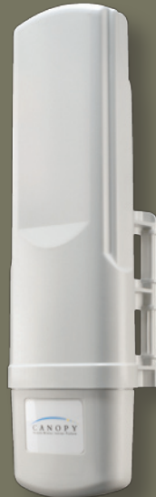
Subscriber Module (SM)