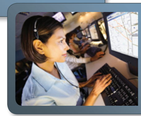
"We didn't want to go the traditional microwave route [with our 9-1-1 backup system]. It was more expensive, labor and maintenance intensive. We are very pleased with our Motorola wireless backup network. We brag about it all the time."

Field Command Centers. When disaster strikes, Motorola Wireless Broadband 4.9 GHz networks provide reliable broadband communications. First responders and rescue workers use our networks to set up temporary command centers at the site of events — ranging from floods to tornados to earthquakes and more — where there is no existing or functioning infrastructure. Using Motorola Wireless Broadband technology, these networks communicate with front-line responders, send real-time data such as video and coordinate all efforts, including those with surrounding municipalities.